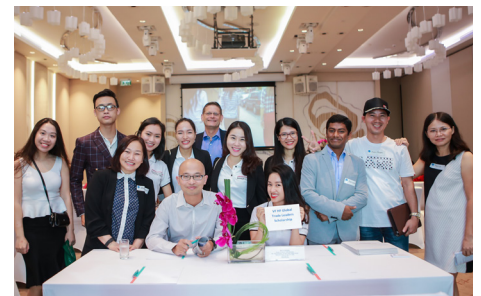
Hinrich Foundation team members and scholars get together during the Global Trade Leaders MBA Scholarship and VF Career Fairs held in Vietnam in March 2016.